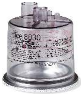
nice 8030 Reusable Adult Humidifier Chamber