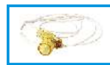
Reusable Heater Wire