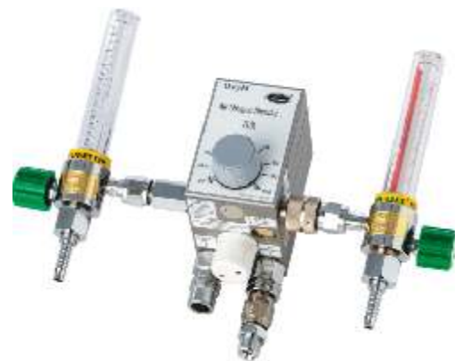
nice 5010 High/Low Flow Air Oxygen Blender Flow meter (optional) 0-15 LPM, 0-3 LPM 0-1 LPM