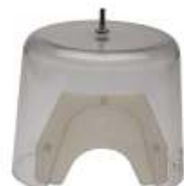
Oxygen Hood Moulded Neck Adjustment with Silicon flap