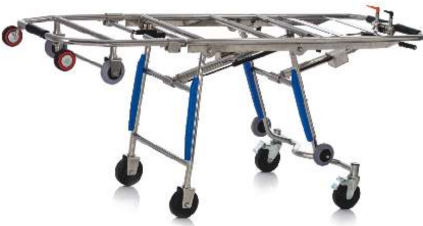
Imported Stainless Steel Auto Loading Trolley (Optional)