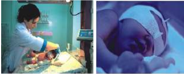
Nasal Prong for the Ventilator (CPAP Mode)