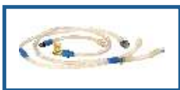
BC 560 - Infant/Neonatal Single Heated Reusable Breathing Circuit for Bubble CPAP

XX-Small - 17 to 19 cm, X-Small 19 to 21 cm, Small 21 to 23 cm, Medium 23 to 25.5 cm, Large 25.5 to 28 cm, X-Large 28 to 30 cm XX-Large 30 to 33 cm, XXX-Large 33 to 36 cm. Head Bonnet & Prongs Selection Guide