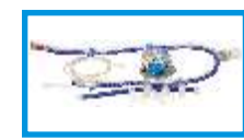
BC 550 - Infant/Neonatal Single Heated Breathing Circuit, SLE Ventilator with Chamber