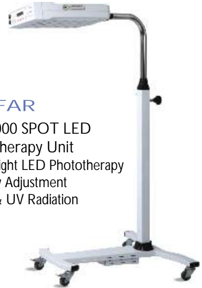
SEEFAR nice 4000 SPOT LED Phototherapy Unit High Bright LED Phototherapy Intensity Adjustment No IR & UV Radiation