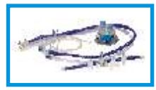
BC 540 - Infant/Neonatal Dual Heated Breathing Circuit for Ventilator with Chamber