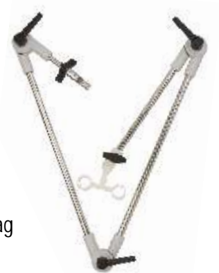
Patient Circuit Arm For Ventilator & Bubble CPAP