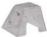
Oxygen Hood Neonatal Neck Adjustment Side Port