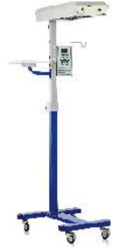
nice 2000 Standalone Infant Radiant Warmer Servo Skin, Pre warm & Manual Mode Control APGAR timer Height adjustable Heater module Sleek & Economic