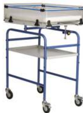
nice 6000 Observation Trolley Collapsible Side Panels Bed tilting