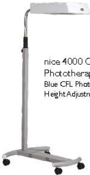
nice 4000 CFL Phototherapy Unit Blue CFL Phototherapy Height Adjustment