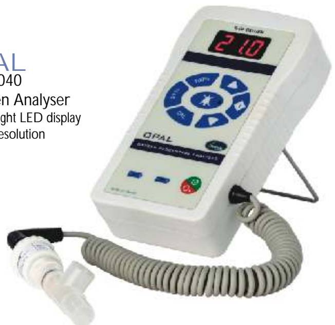
nice 5040 Oxygen Analyser High Bright LED display 0.1% Resolution