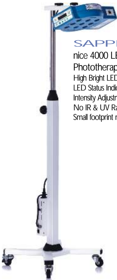
SAPPHIRE nice 4000 LED Phototherapy Unit High Bright LED Phototherapy LED Status Indication Intensity Adjustment No IR & UV Radiation Small footprint mild steel base