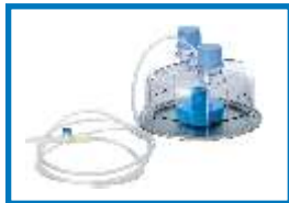
Adult disposable Auto feed water chamber