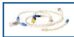
BC 565 - Infant/Neonatal Single Heated Reusable Breathing Circuit for Ventilator