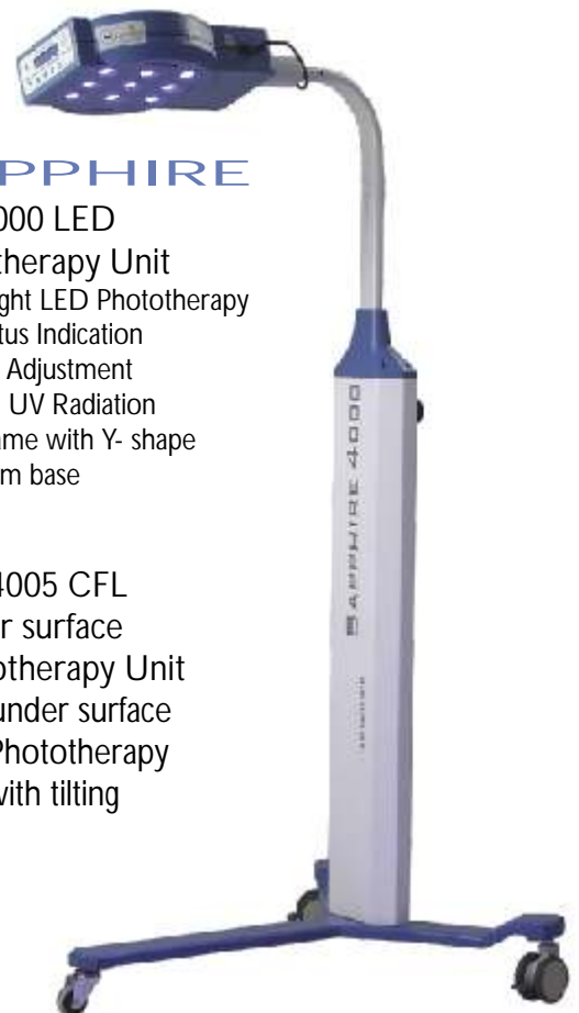
SAPPHIRE nice 4000 LED Phototherapy Unit High Bright LED Phototherapy LED Status Indication Intensity Adjustment No IR & UV Radiation Wide frame with Y- shape aluminium base