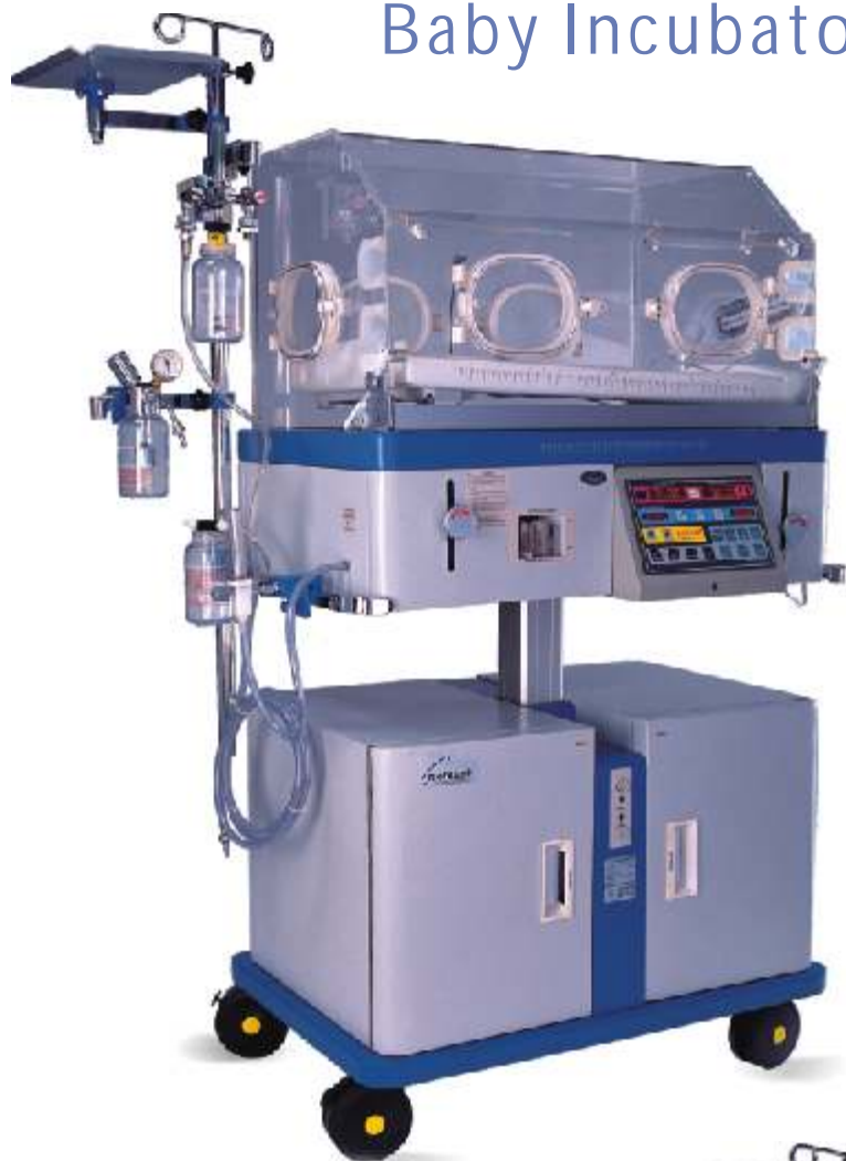
nice 3010H Baby Incubator Electrical Height Adjustment Servo Skin & Air Mode Control Centrifugal Blower for fresh gas