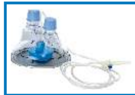
Neonatal disposable Auto feed water chamber