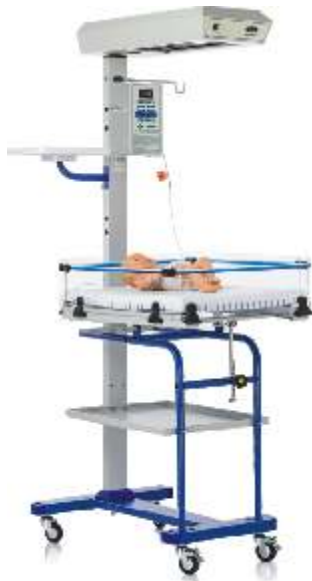
nice 2000 B Infant Radiant Warmer Servo Skin, Pre warm & Manual Mode Control APGAR timer Sleek & Economic