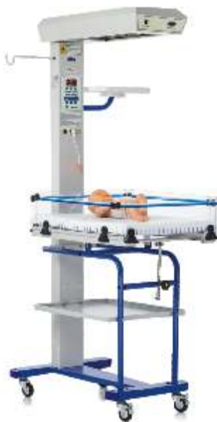
nice 2007 S Infant Radiant Warmer Servo Skin, Servo Air, Pre warm & Manual Mode Control APGAR timer Sleek & Economic Servo Air mode (Optional)