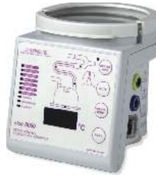
nice 8050 Servo Control Respiratory Humidifier Invasive & Non Invasive Mode Flow detection Heater Wire