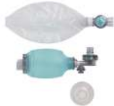
Manual Resuscitation Bag 250ml Silicon