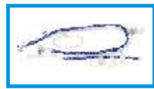
BC 515 - Infant/Neonatal Single Heated Breathing Circuit for Ventilator w/o Chamber