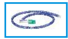
T-Piece Resuscitator Circuit (Test lung optional)