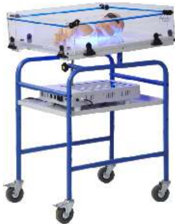
nice 4005 SPOT Under surface LED Phototherapy Unit Blue under surface High Bright LED Phototherapy Bed with tilting