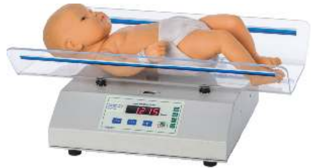
nice 1000 Baby Weighing Scale 5 gram accuracy, Tare facility, Hold function, Damping facility.