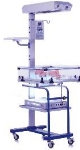
nice 2000 CFL Infant Radiant Warmer with CFL Phototherapy Servo Skin, Pre warm & Manual Mode Control APGAR timer Under surface CFL Phototherapy Sleek & Economic