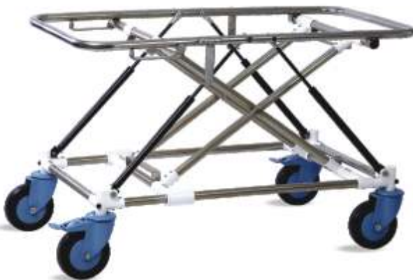
Stainless Steel ICU Trolley