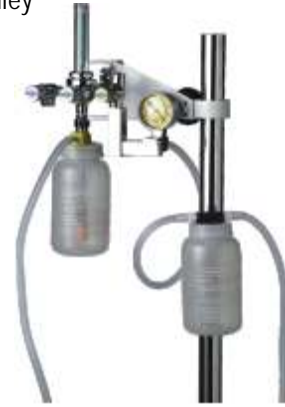
Venturi Slow Suction & Humidified Oxygen