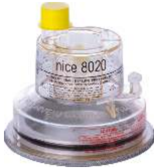
nice 8020 Reusable Neonatal Humidifier Chamber