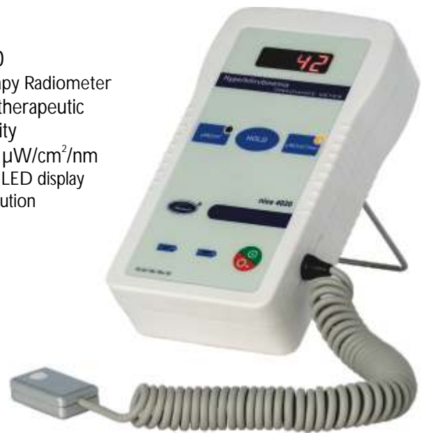
nice 4020 Phototherapy Radiometer Measures therapeutic light intensity \mu\text{W}/\text{cm}^2 & \mu\text{W}/\text{cm}^2/\text{nm} High Bright LED display 0.1% Resolution