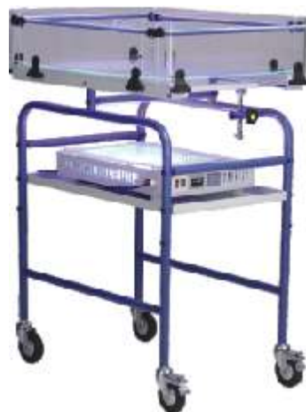
nice 4005 CFL Under surface Phototherapy Unit Blue under surface CFL Phototherapy Bed with tilting