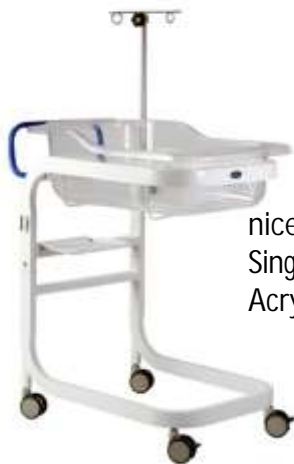
nice 6000 M Baby Bassinet Single moulded transparent Acrylic Bassinet