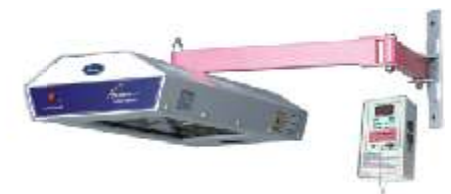
nice 2007 SW Infant Radiant Warmer Servo Skin, Pre warm & Manual Mode Control APGAR Timer Wall Mount