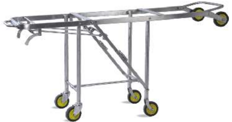
Stainless Steel Auto Loading Trolley