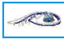
BC 530 - Infant/Neonatal Single Heated T Bar Prong type breathing Circuit with Chamber