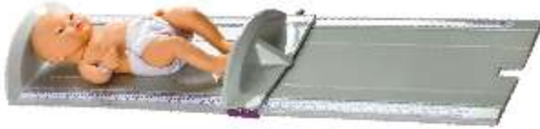
nice 1050 Infantometer 0-1000 mm Length, 1mm Resolution, Headsupport, Movable leg support and Foldable.