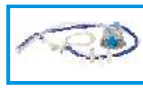
BC 555 - Infant/Neonatal Single Heated Breathing Circuit for Bubble CPAP with Chamber