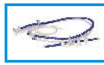
BC 520 - Infant/Neonatal Dual Heated Breathing Circuit for Ventilator w/o Chamber