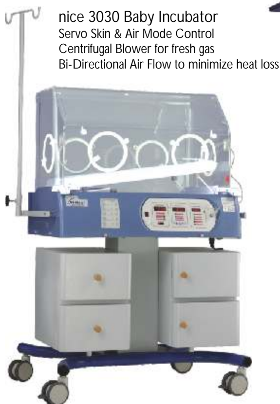
nice 3030 Baby Incubator Servo Skin & Air Mode Control Centrifugal Blower for fresh gas Bi-Directional Air Flow to minimize heat loss