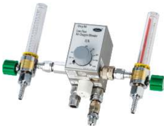
nice 5005 Low Flow Air Oxygen Blender Flow meter (optional) 0-15 LPM, 0-3 LPM 0-1 LPM