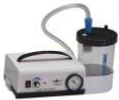
Electrical Slow Suction Polycarbonate Jar 0- 400 mmHg