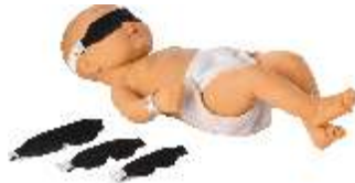
Phototherapy Eye Mask Size: Small, Medium & Large