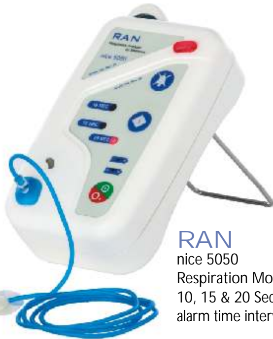
RAN nice 5050 Respiration Monitor 10, 15 & 20 Second alarm time interval