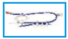
BC 545 - Infant/Neonatal Single Heated Breathing Circuit, SLE Ventilator w/o Chamber