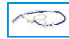
BC 510 - Infant/Neonatal Single Heated Breathing Circuit for Bubble CPAP w/o Chamber