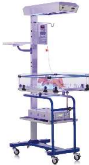
nice 2000 CFL Infant Radiant Warmer with LED Phototherapy Servo Skin, Pre warm & Manual Mode Control APGAR timer Under surface LED Phototherapy Sleek & Economic