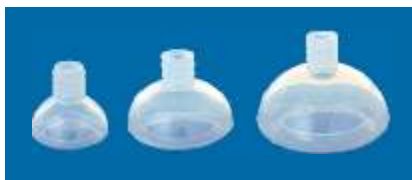
Resuscitation Mask Size: 00, 0 and 1