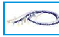
BC 525 - Infant/Neonatal Single Heated T Bar Prong type breathing Circuit w/o Chamber