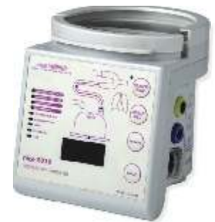
nice 8010 Respiratory Humidifier High/Medium/Low Setting Heater Wire