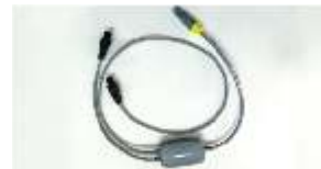
Dual Heater Wire Adapter for Disposable Circuit