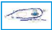
BC 535 - Infant/Neonatal Single Heated Breathing Circuit for Ventilator with Chamber