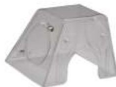
Oxygen Hood Paediatric Neck Adjustment Side Port