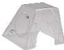
Oxygen Hood Infant Neck Adjustment Side Port